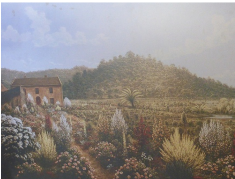
The farm and garden as it was