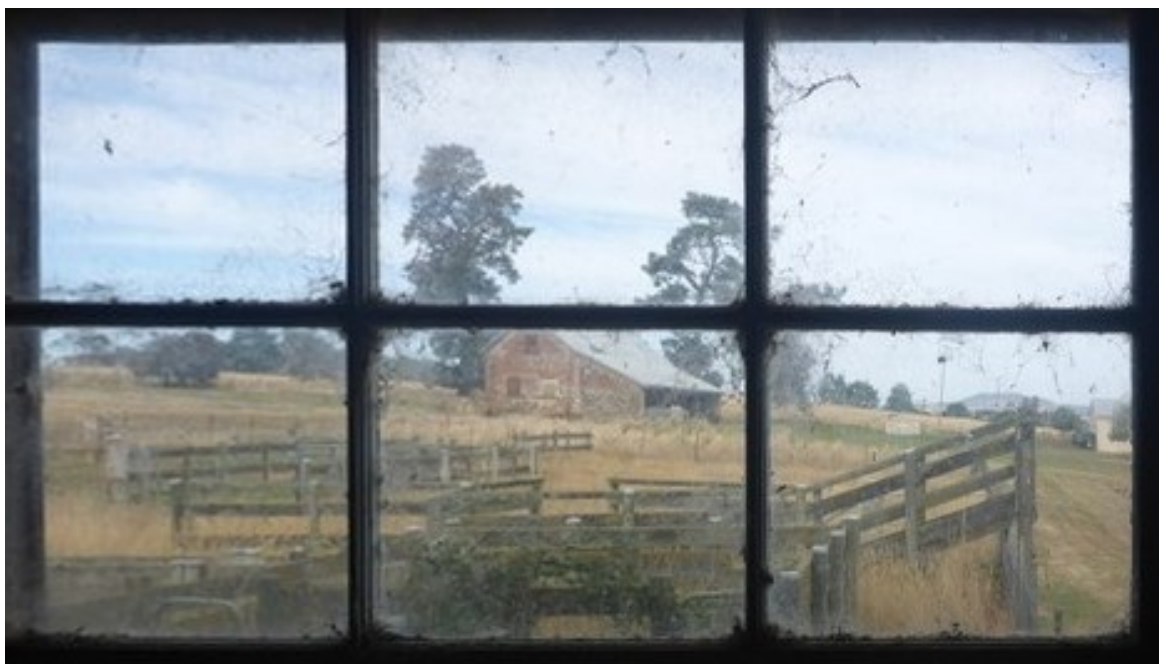
Looking through the Wool Shed window, Woolmers