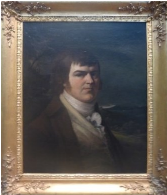
John Glover Self Portrait Queen Victoria Art Gallery Launceston

John Glover, Landscape Painter, was born in 1767 near Leicester, UK. He worked the fields and became a nature lover and renowned painter in oil and water colour. However the Royal Academy displayed this latter genre poorly and he was never appointed as a member.