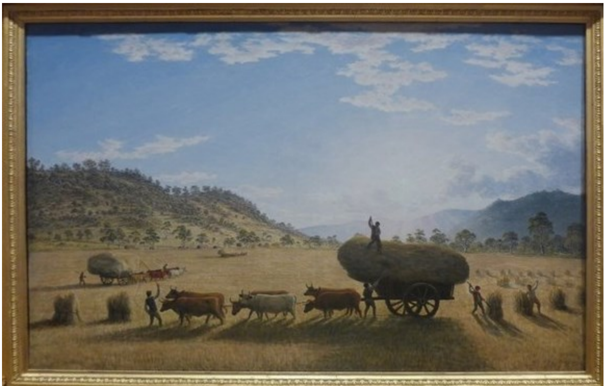
"My Harvest Home" John Glover 1835 – noting his rising status as a gentleman farmer, endorsed by the depiction of assigned convicts who are labouring in red vests. (Tasmanian Museum and Art Gallery)

We started with a delightful walk through Salamanca Place, and opposite Constitution Dock to visit the Tasmanian Museum and Art Gallery. We were treated once again to an excellent guided tour.