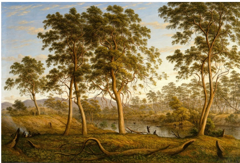
John Glover "Natives on The Ouse River Van Diemen's Land" 1838 AGNSW