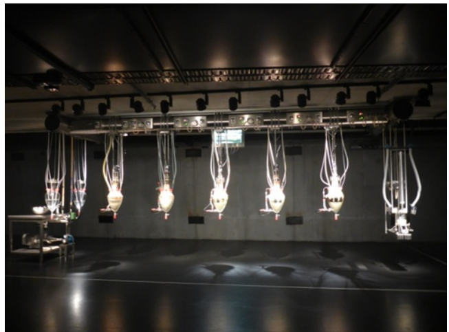
The infamous "Cloaca Professional", fondly called the Poo Machine, is fed at 11 am and produces at 2pm daily. It is apparently a commentary about art being shit.

Another confronting area is a wall of 151 porcelain moulds of female genitalia. Each to his/her/its own!