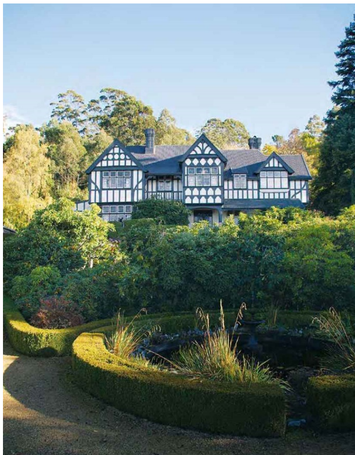
High Peak House, Mt Wellington

members of ADFAS Hobart, who kindly took us on a tour of the garden, then provided a splendid afternoon tea and tour of the features of their home, which they dearly love.