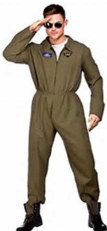
Our group descended to the Ferry to take us back to Hobart; even the dedicated MONA transport is an art work, painted in camouflage colours, and the on board workers look like Top Gun Pilots.