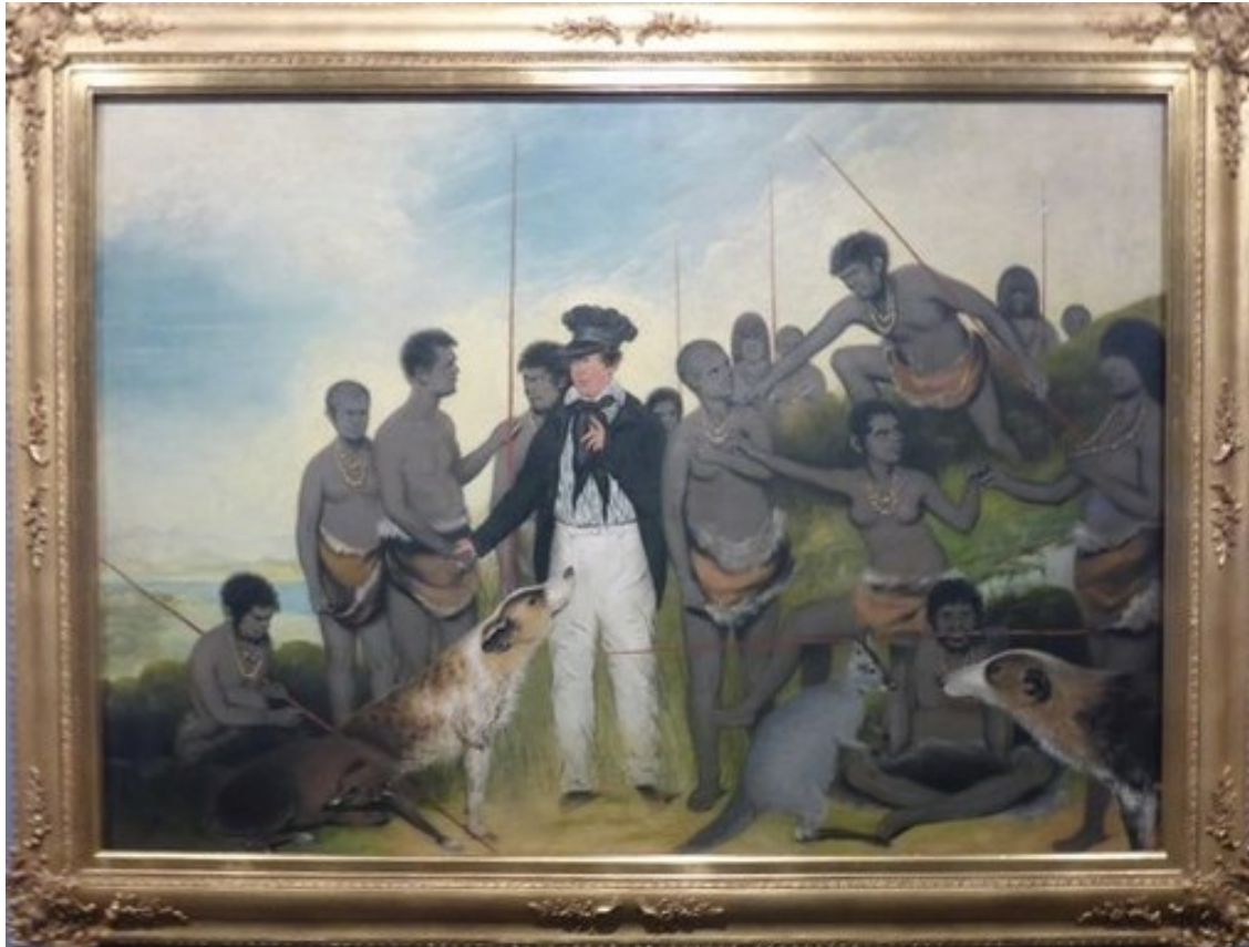
"The Conciliation" 1840 – depicts the 1831 meeting between George Augustus Robinson and the Big River and Oyster Bay tribes, the last of the free Aboriginal people captured during the Friendly mission. By the time the picture was painted, the Flinders Island Mission had been a disastrous failure.