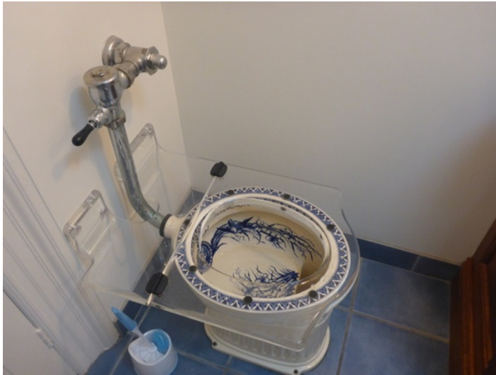
We were all invited to use the "special toilet" at High Peak House

late 1800's. It is one of the few heritage Tudor-style buildings in Tasmania. The exterior woodwork is of exceptional King Billy Pine from trees cleared on the site. The garden has rare monkey puzzle trees and giant sequoia trees, which can live for thousands of years.