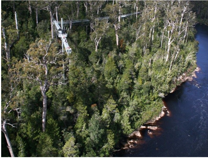
The thrill of the Airwalk over the Huon and Picton Rivers

members of ADFAS Hobart, who kindly took us on a tour of the garden, then provided a splendid afternoon tea and tour of the features of their home, which they dearly love.