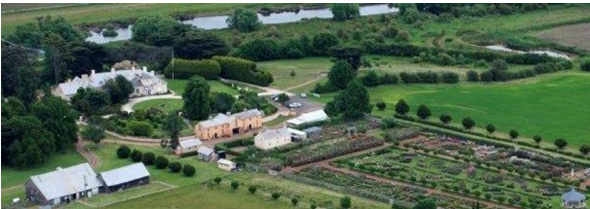
Woolmers Estate from the Air

He took advantage of the boom in the British wool industry from 1820s to 1840s to gain economic success but the property was never again farmed by his several descendants.