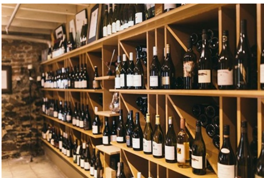
Imagine letting us in here for our meal!

We celebrated the start of our tour with a friendly welcome dinner at "Stillwater", one of Launceston's premier restaurants, located on