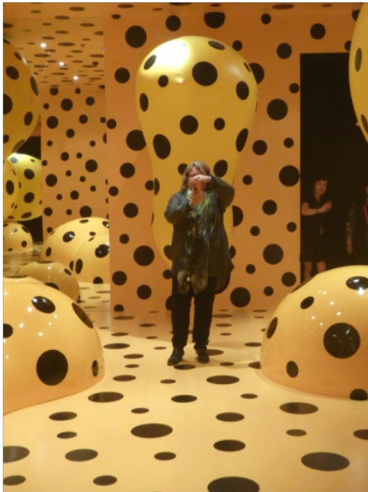
Yours truly in one of the exhibitions "The Origin of Art"

Another confronting area is a wall of 151 porcelain moulds of female genitalia. Each to his/her/its own!