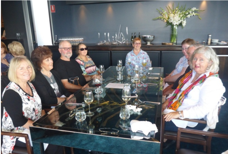
Enjoying a lunch at “The Source” before visiting the exhibits at The Museum of Old and New Art....MONA

Sustenance was provided by a magnificent lunch in “The Source” Restaurant at MONA, with a view of the Derwent and an artwork in itself. In fact, all of MONA is an artwork.